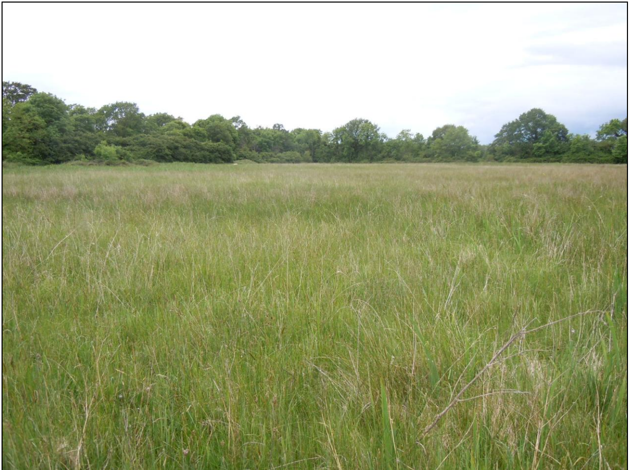
Photo 2. GL1C Molinia caerulea – Succisa pratensis grassland, Cahirguillamore, Limerick