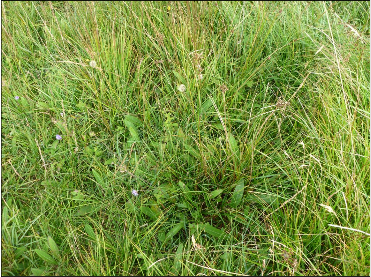
Photo 1. GL1C Molinia caerulea – Succisa pratensis grassland, Dunshane Common, Kildare (E. Cole/J. Denyer, September 2010)