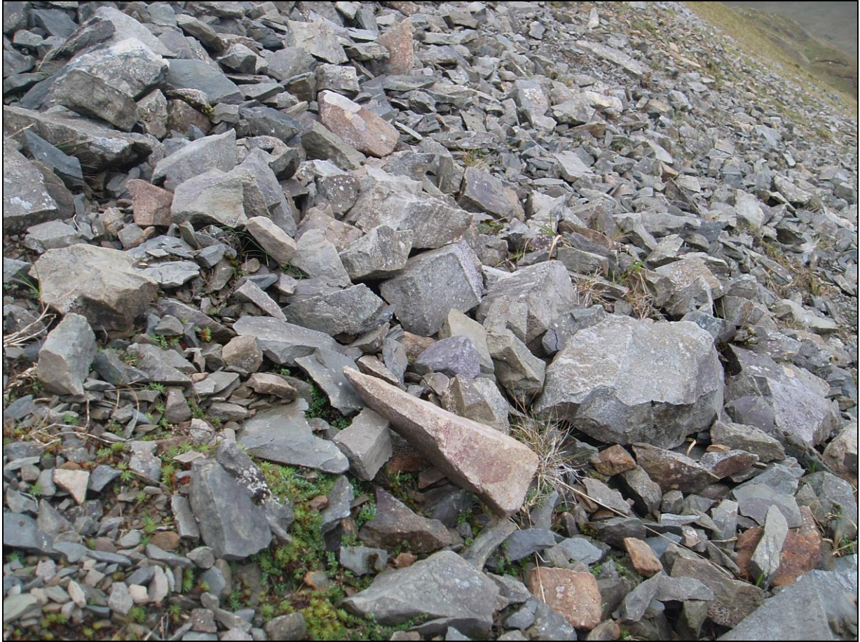
Photo 1. RH2B Racomitrium fasciculare – Festuca vivipara scree community, Tawnyinlough, Ben Creggan, Mayo