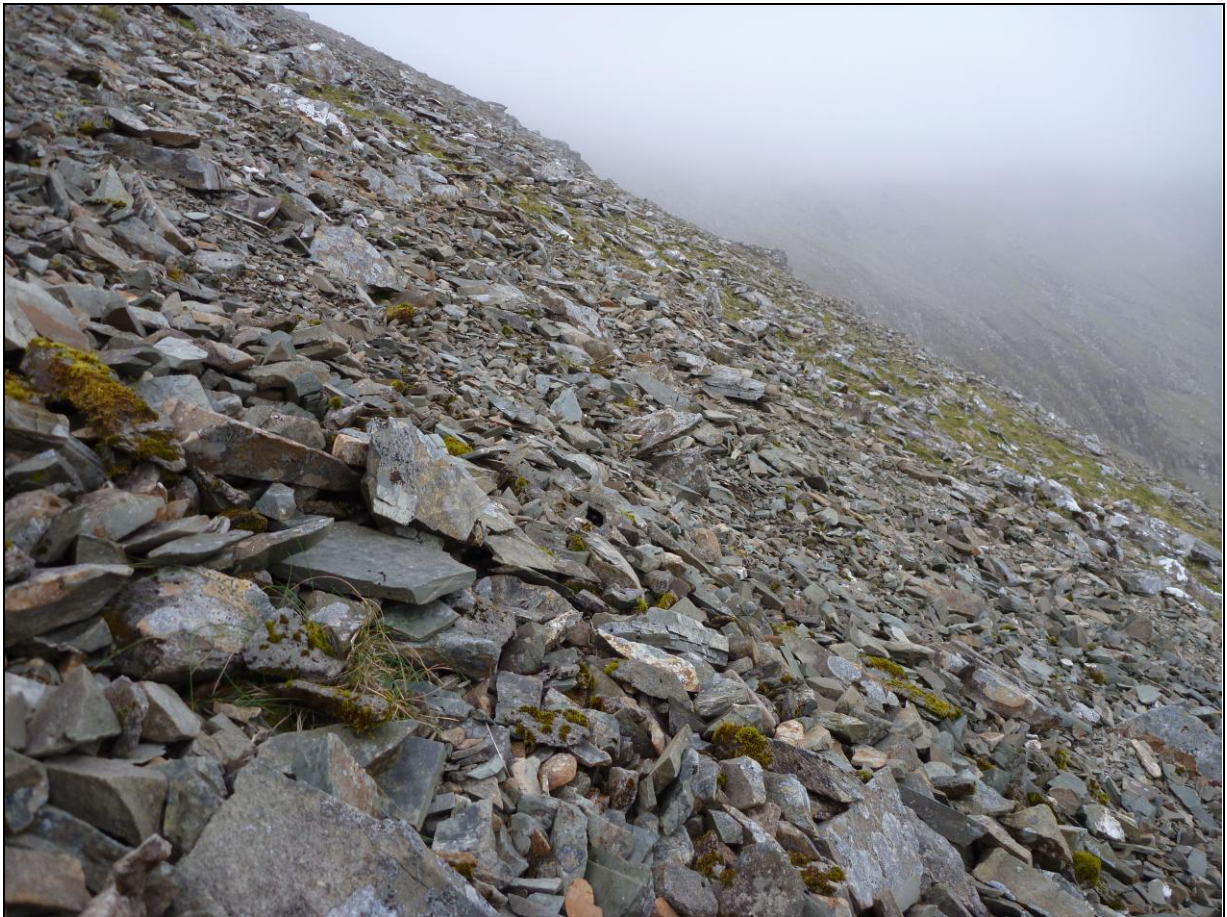
Photo 2. RH2B Racomitrium fasciculare – Festuca vivipara scree community, Laghta Oughter, Sheeffry Hills, Mayo