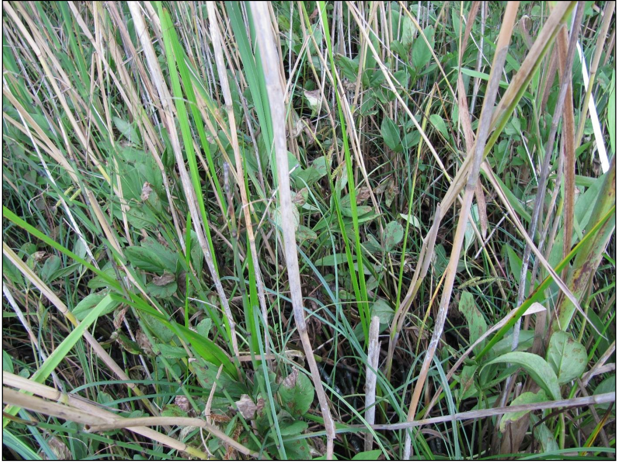
Photo 1. FE2A Equisetum fluviatile – Menyanthes trifoliata mire, River Corrib, Menlough, Galway (F. O'Neill, August 2014)