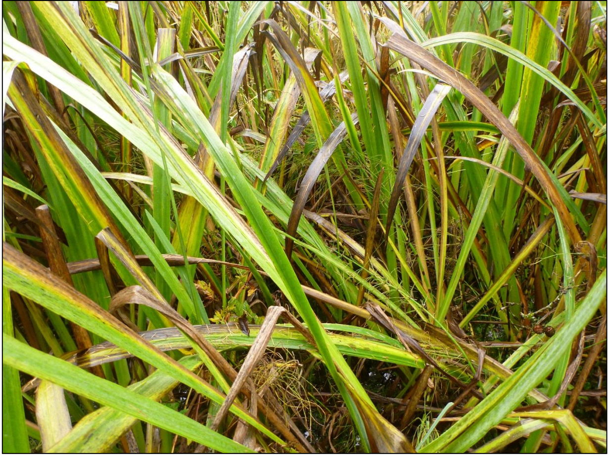
Photo 1. FW3G Equisetum fluviatile - Eleocharis palustris swamp, near Lough Owell, Westmeath (J. Brophy, October 2014)