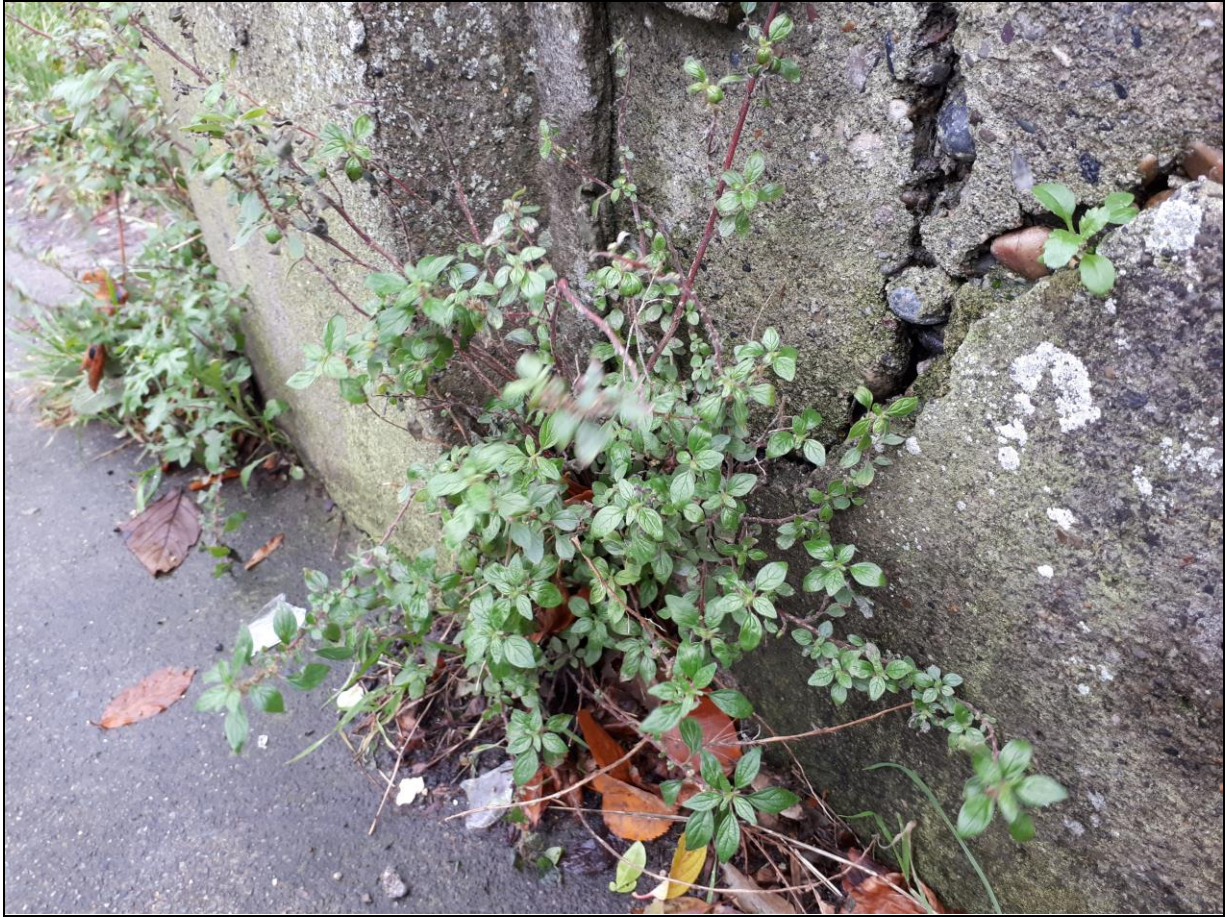
Photo 1. Vegetation ascribable to RH1D Parietaria judaica – Tortula muralis wall community, Bray, Wicklow (P. Perrin, November 2019)