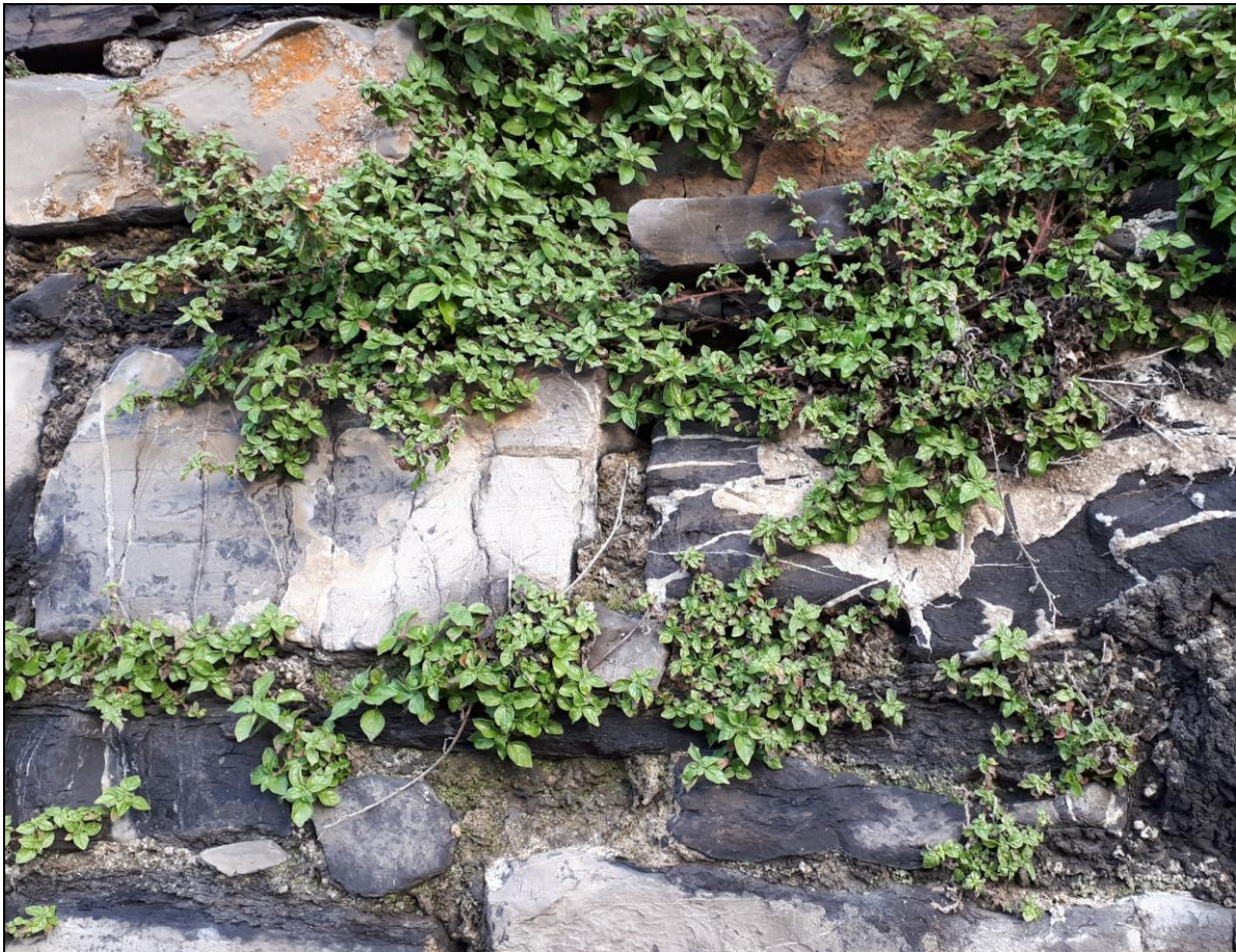
Photo 2. Vegetation ascribable to RH1D Parietaria judaica – Tortula muralis wall community, Smithfield, Dublin (F. O'Neill, November 2019)