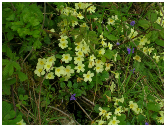
Fig. 1: Typical woodland flora species found in hedgerows, i.e. primroses ( Primula vulgaris ) and violets ( Viola riviniana ), Co. Longford.

While older hedges certainly exist, the majority of the hedgerow network in Ireland was initially established in the middle of the 18 th century to provide agricultural services, primarily land delineation, stock control, shade and shelter. In addition to their agricultural functions, hedgerows are one of the most widespread semi-natural habitats in the country, due to their extent, connectivity, structure and composition, and require further research to quantify their biodiversity values. Additionally, the hedgerow network is acknowledged to provide a range of Ecosystem Services, including Provisioning Services (i.e. food and fuel), Regulation Services (i.e. air quality, climate moderation, water quality, soil erosion control, disease management, pest control and pollination), Cultural Services (i.e. aesthetic value, educational and recreational), and Support Services (i.e. soil formation, photosynthesis and nutrient cycling) (Land Use Consultants, 2009).