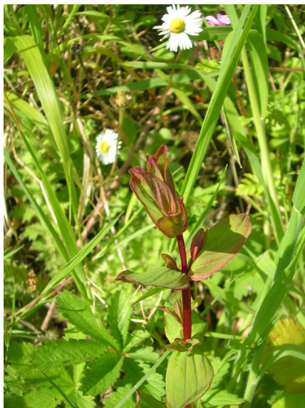
Fig. 6: Hedgerows often contain a rich array of ground flora species such as tutsan ( Hypericum androsaemum ), Co. Kildare.