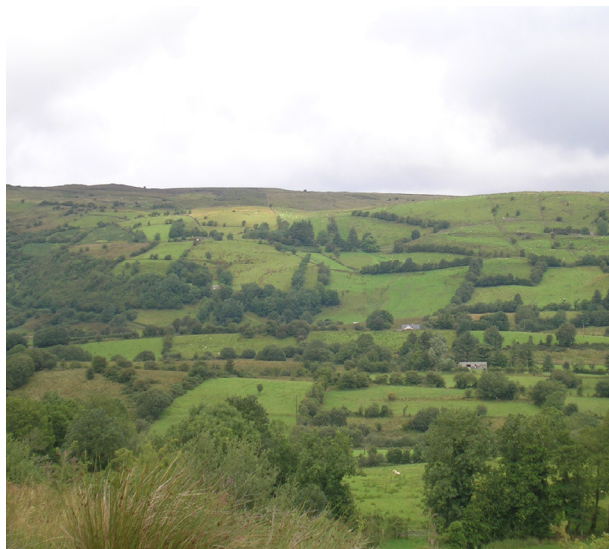
Fig. 3: Hedgerow connectivity with scrub woodland, Co. Leitrim.

For the purpose of recording qualitative data, a maximum of 10 hedges are surveyed in each square. Hedges for sampling are identified prior to the fieldwork in the following way. A transparent overlay of the square is divided into equal square quarters. Using a random number generator and a grid pattern, two random points are identified in each quarter. A further two random points are generated for the square as a whole. By placing the overlay over the aerial photograph of the square, the nearest hedge of at least 60m in length to each random point is identified and numbered (1-10). If it is unclear from the photograph whether a particular linear feature is a hedge or not, a second (and occasionally third) potential sample hedge can also be noted using the same principle (e.g. 1a, 1b, etc.). Where there is no hedge within a fixed radius ( r ) cm of the random point, no hedge is recorded and the total number of hedge recordings for the square is reduced by one. This is to prevent skewing the sampling density in favour of certain landscape types.