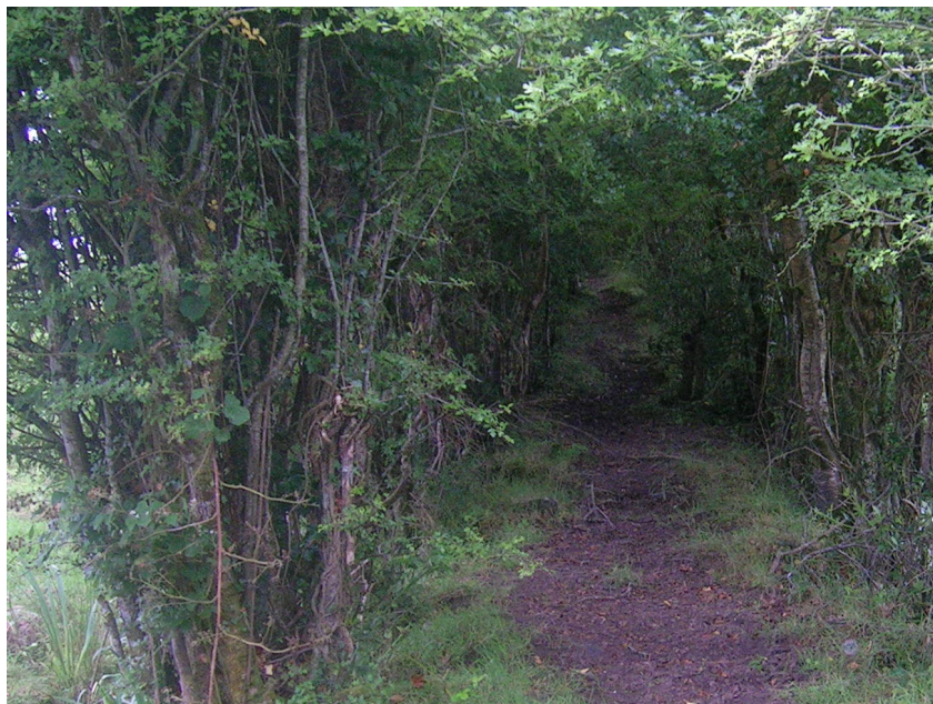
Fig. 4: An example of a double row hedge and potentially a Heritage Hedgerow, Co. Mayo.