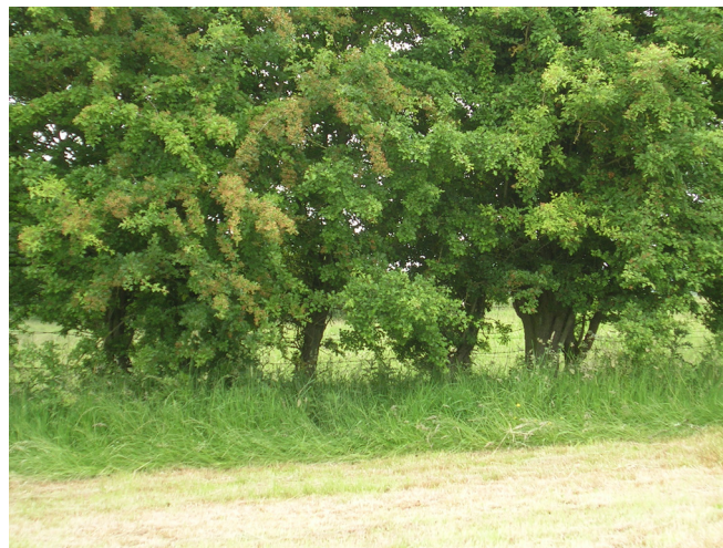
Fig. 2: A typical hedgerow with an open base indicative of abandoned management, Co. Monaghan.

Hedgerow conservation policy in Ireland is embraced primarily through national legislation and incentive, especially agriculturally-related schemes. A number of County Councils also espouse hedgerow policy in County Development Plans. Nonetheless, hedgerow policy and legislation does not necessarily equate with protection and many hedgerows have been removed in recent years as a result of agricultural intensification, new road schemes and building developments. In addition, management is generally poor due to a lack of skills-based knowledge and resources. For convenience and cost-effectiveness, management often entails flailing which, if done without skill and due care, has a tendency to weaken the shrubs in the hedgerow. Therefore, any attempt to promote hedgerow conservation through management needs to be based on a systematic assessment of the current resource, a meaningful interpretation of the data collected and appropriate management.