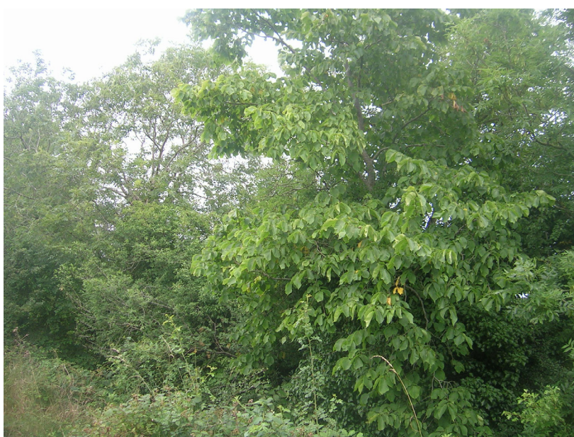
Fig. 5: A potential Heritage Hedgerow derived from Old or Ancient woodland containing Wych elm ( Ulmus glabra ) and spindle ( Euonymus europaeus ), Co. Leitrim.

Record the presence of any of the ground flora species listed in Appendix E within one metre of each side of the hedge in each of the 30m strips.