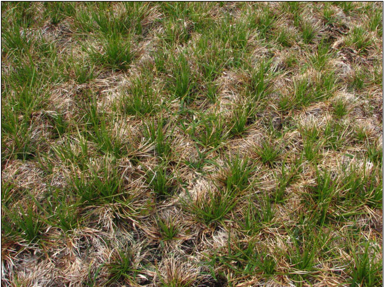
Photo 2: HE3G Juncus squarrosus – Rhytidiadelphus loreus heath, Truskmore, Dartry Mountains, Sligo (B. O'Hanrahan, June 2009).