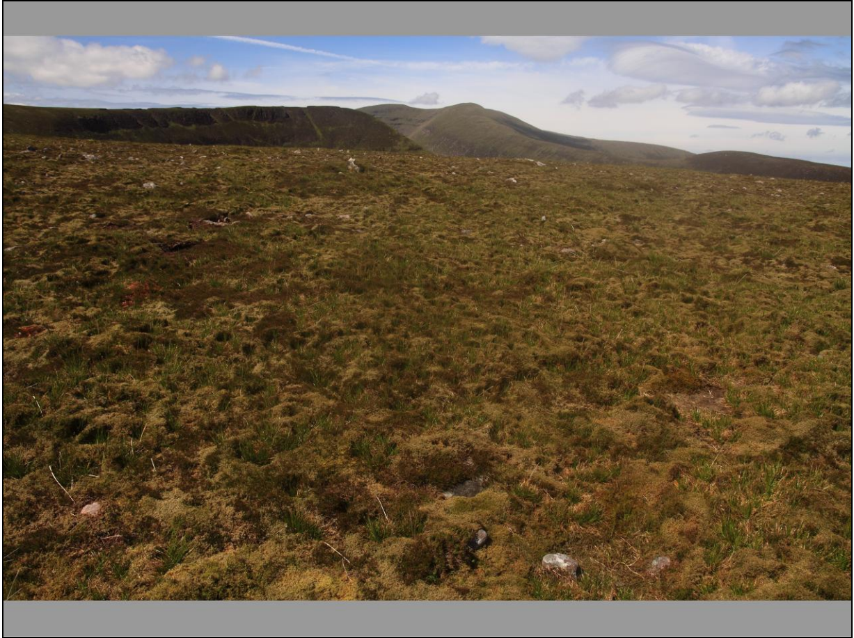
Photo 1: HE3G Juncus squarrosus – Rhytidiadelphus loreus heath, Knockauncorragh, Slieve Mish Mountains, Kerry (R. Hodd, June 2014).