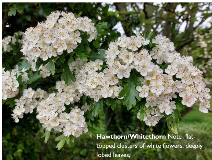
Hawthorn/Whitethorn Note flat-topped clusters of white flowers, deeply lobed leaves,